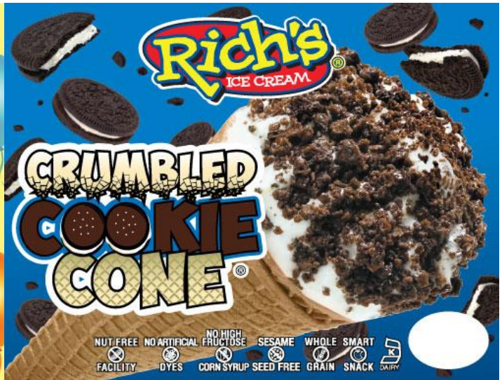
Crumbled Cookie Cone. $1.50