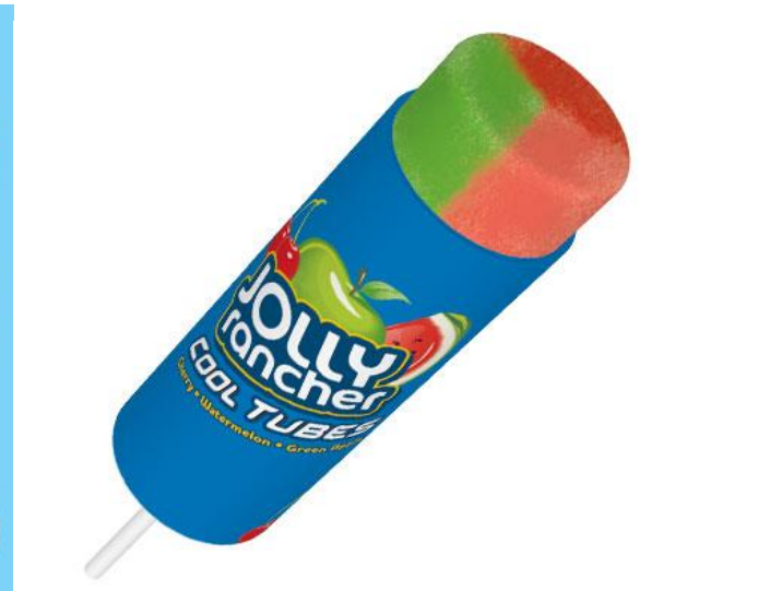
Blue Bunny Jolly Rancher Push Up Pop $1.50