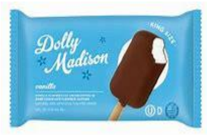
Dolly Madison – Vanilla Bar $1.50