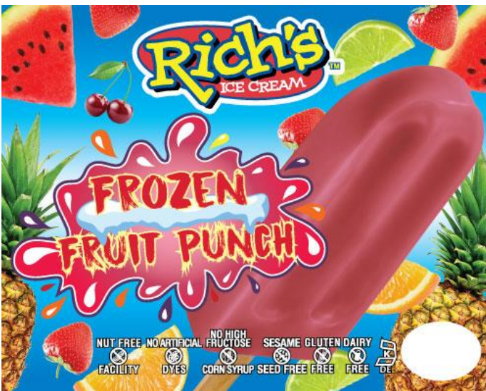
Frozen Fruit Punch Bar $1.50