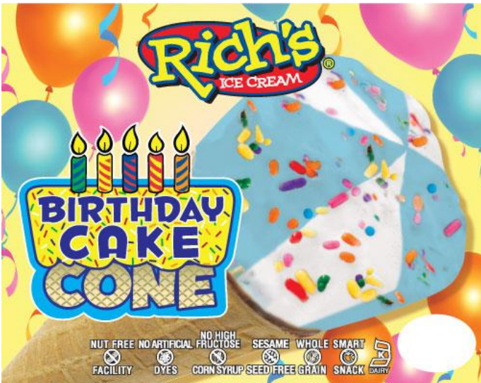
Birthday Cake Cone $1.50