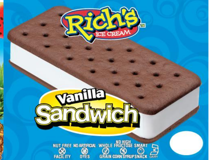
Vanilla Sandwich $1.50