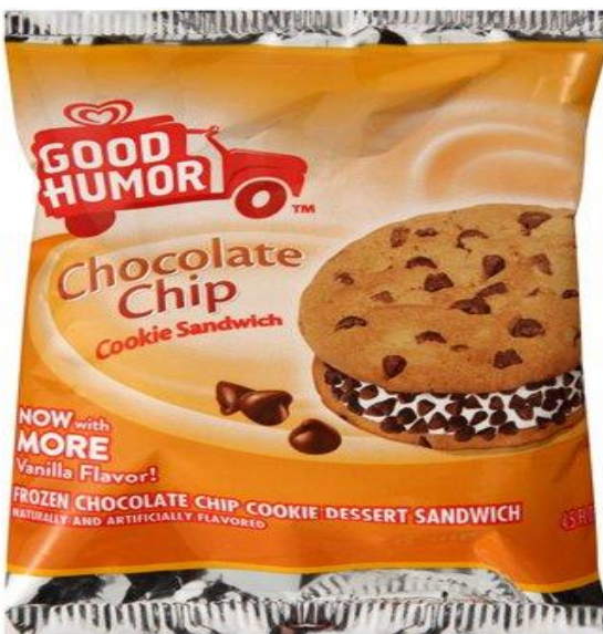
Good Humor Chipwich Sandwich $2.00