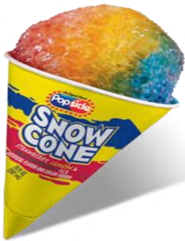
Good Humor Popsicle Snow Cone $2.00