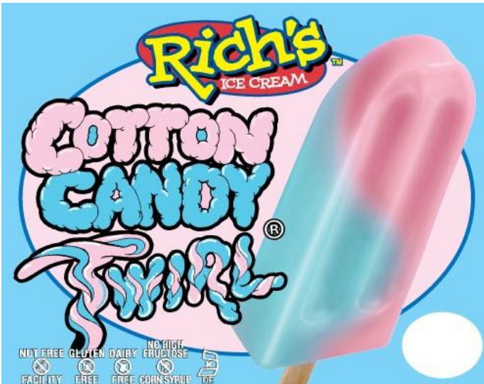
Cotton Candy Twirl $1.50