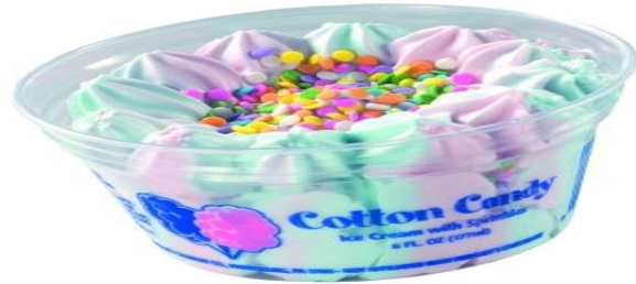
Dolly Madison Cotton Candy Cup $2.00